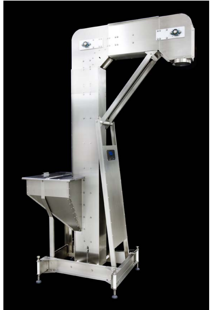
Vertical Cap Elevator (model with reduced foot-print)

Call your sales representative for additional details.